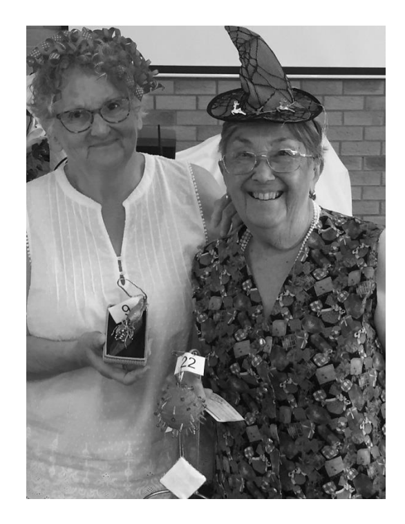
Christmas challenge entries