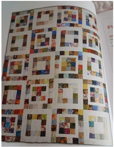
Flowerbed by Joan Ford. -'Scraps plus One