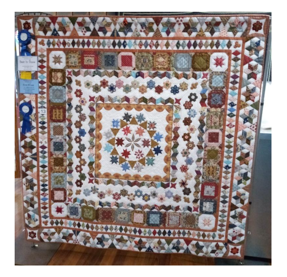
<u>Best in Show</u> By Glenys Waldbridge